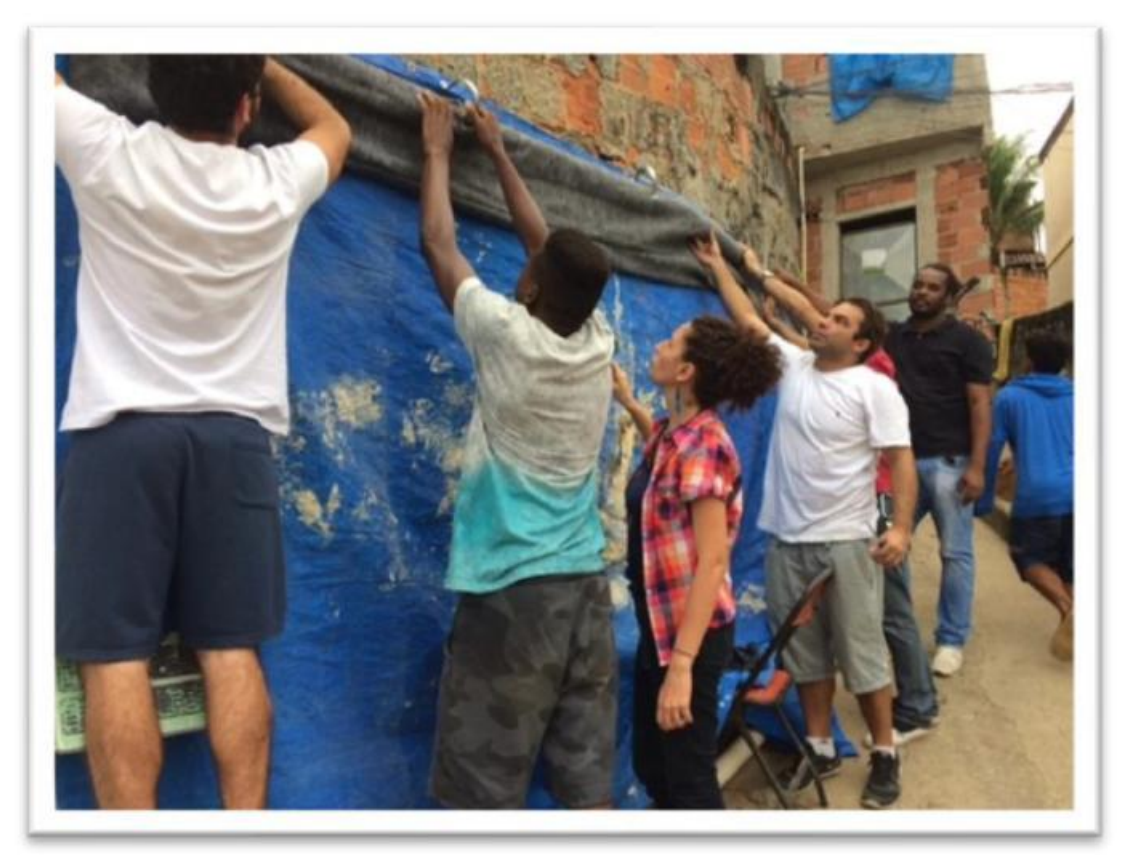
Figure 5: Setting up the bidim mantle with tubes, 2017