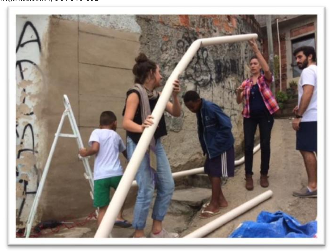
Figure 4: Attaching the tubes at the wall/Morro do Palácio, 2017