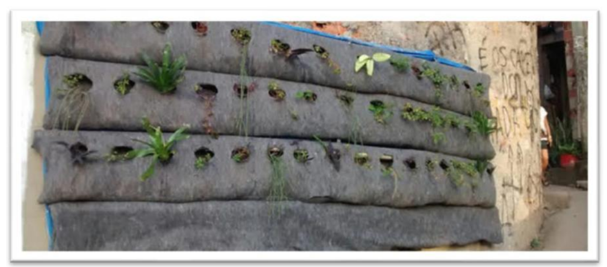
Figure 8: Prototype/Green Wall/Peace Alley, 2017

The purpose of the project relates opening the debates with "favela" inhabitants around the validity of the design and the construction of prototypes of Green Walls and Indigenous Graphism by faculty members of the University Federal Fluminense/UFF, counting on the participation of more than 400 builders of Morro do Palácio, Niterói, Rio de Janeiro.