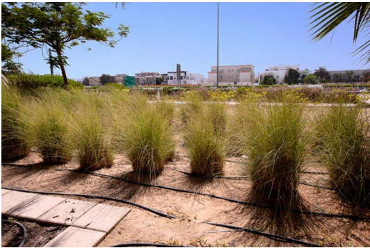
Figure 1: Xeriscaping from Out of Place