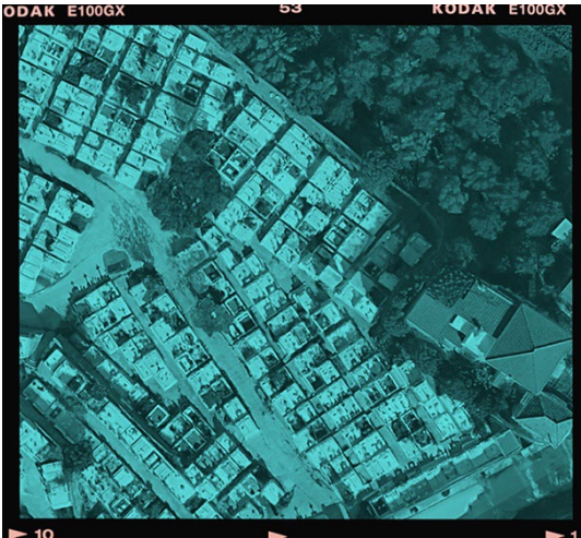
Figure 2: Rooted–Uprooted from Home No Home