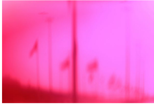
Figure 4: Constant Farewell from Photographing the Unphotographable